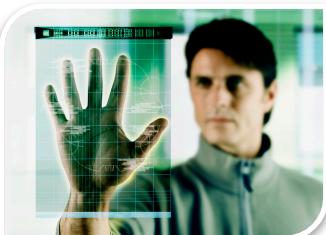
NEW GENERATION INFORMATION TECHNOLOGIES