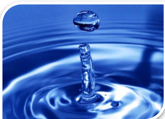
ENERGY SAVING AND ENVIRONMENTAL PROTECTION